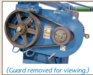
(Guard removed for viewing.)

Choice of volume output: Choose from 7½ - 40 HP single motor speed packages or 7½ and 10 HP matched twin motor speed packages along with the appropriate motor(s) to obtain the desired flow rate. Output capacities range up to 1,580 gallons (5,981 liters) per minute at 10 ft. (3.1 m) head. Capacities are based on water.