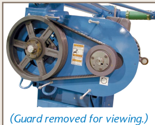
(Guard removed for viewing.)

A steel mounting plate is included as standard equipment to allow precise positioning of the pump to match the pit depth. Plate can be lagged to a concrete pad or curb.