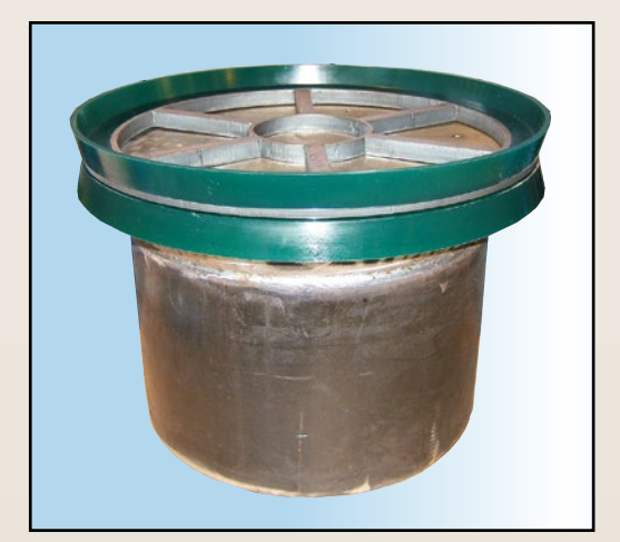
Tundra<sup>™</sup> Pro Pump's piston includes two abrasion resisting seals for maximum pumping performance and a long working life. Seals are oxygen and ozone resisting.

Tundra™ Pro Pump is designed to pump heavy materials long distances, up to 600 ft., using minimal horsepower.