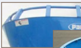
Pipe Hay Retainer

Bolted to the top of the mixer tub, hay retainers help guide dry hay inside the tub during mixing.