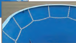
Chain Hay Retainer