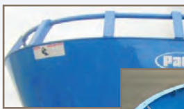
Pipe Hay Retainer

Bolted to the top of the mixer tub, hay retainers help guide dry hay inside the tub during mixing.