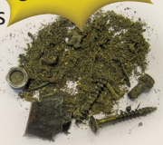
Actual tramp metal removed from magnet.

Encased in stainless steel, this magnet is mounted into the Patz Vertical Mixer tub wall on a hinged assembly for effective removal of tramp metal from rations.