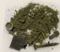
Actual tramp metal removed from magnet.

Encased in stainless steel, this patented magnet is strong enough to pull tramp metal from the ration while mixing. Mounted into the Patz Vertical Mixer tub wall, a hinged assembly was designed for safe removal of tramp metal.