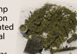
Actual tramp metal removed from magnet.

Encased in stainless steel, this patented magnet is strong enough to pull tramp metal from the ration while mixing. Mounted into the Patz Vertical Mixer tub wall, a hinged assembly was designed for safe removal of tramp metal.