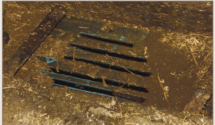
Liquids drop through the screen into the sump. Two screen sizes available: 3/8-inch (9.525 mm) and 5/8-inch (15.875 mm).

“You don't realize how much liquid is in the gutter. You would be surprised at how much liquid comes out of that pipe.”