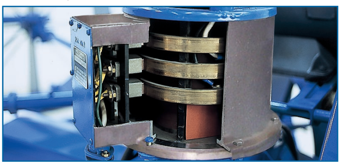
Shown cut-away for viewing

Patz gathering chain and sprockets, manufactured using state-of-the-art techniques and heat treating process, enable a precise degree of hardening. Includes closed-die forged hardened cutters and claws for superior strength and performance resulting in high volume delivery for fast feeding. All-welded construction eliminates points of corrosion.