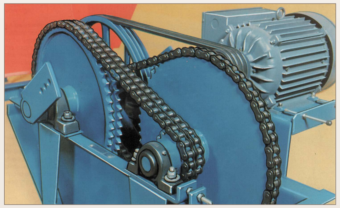
Drive Unit uses 10 hp. electric motor. Plunger driven through triple V-belt, double #100 roller chain-and-sprocket drive unit. Large 2-1/2 inch and 1-3/4 inch shafts plus high quality bearings assure durable operation. (Guard removed for viewing).