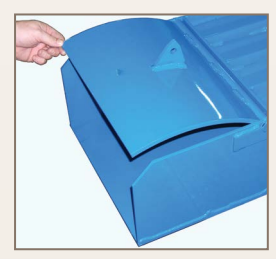
Plunger sleeve with internally functioning plunger mounts in 1/4-inch thick steel chamber embedded in concrete. Plunger and plunger sleeve may be removed for easy servicing without concrete breakup.