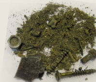
Actual tramp metal removed from magnet.

Encased in stainless steel, this patented magnet is strong enough to pull tramp metal from the ration while mixing. Mounted into the Patz Vertical Mixer tub wall, a hinged assembly was designed for safe removal of tramp metal.