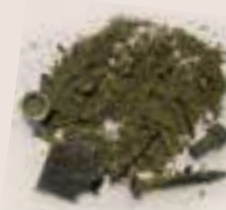
Actual tramp metal removed from magnet.

Encased in stainless steel, this patented magnet is strong enough to pull tramp metal from the ration while mixing. Mounted into the Patz Vertical Mixer tub wall, a hinged assembly was designed for safe removal of tramp metal.