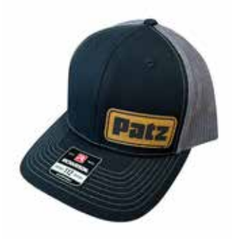
PA-26105 Black & Grey Side Rectangle Patch Hat