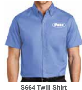
3.4-ounce, 55/45 cotton/poly

Colors: Turquoise (Shown), Strong Blue, Royal, Charcoal Heather Grey, Stone, Black