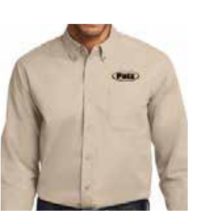
S608 Easy Care Shirt 4.5-ounce, 55/45 cotton/ vloq

Colors: Royal (Shown), Charcoal, Navy, Jet Black, Aquatic Blue, Light Blue