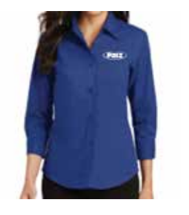
L612 3/4-Sleeve Easv Care Shirt 4.5-ounce, 55/45 cotton/poly

Colors: Royal (Shown), Strong Blue, Light Stone, White, Jet Black