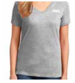
LPC54V Core Cotton V-Neck Tee 5.4-ounce, 100% cotton

Colors: Royal (Shown), Charcoal, Navy, Jet Black, Aquatic Blue, Liaht Blue