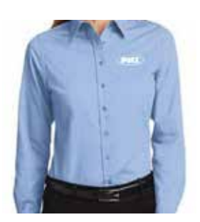
L608 Easy Care Shirt 4.5-ounce, 55/45 cotton/poly

Colors: Royal (Shown), Strong Blue, Light Stone, White, Jet Black