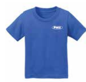
CAR54i Core Cotton Tee 5.4-ounce, 100% cotton (6 Mo-18 Mo) Colors: Royal (Shown), Navy, Black, Pink, Red, Aquatic Blue, Lime