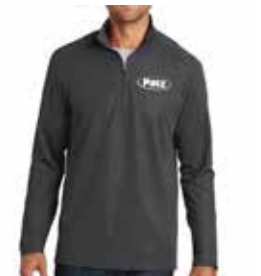
K806 Pinpoint Mesh 1/2-Zip 4.3-ounce, 100% polyester

Colors: Ultramarine Blue (Shown), True Blue, True Navy, Black, Sterling Grey, Monument Grey, White