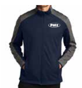
J718 Active Colorblock Soft Shell Jacket 100% polyester knit shell and 100% polyester mesh interior

Colors: Dress Blue Navy/Grey Steel (shown), Deep Black/Grey Steel