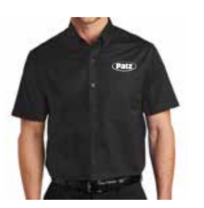
S508 Easy Care Shirt 4.5-ounce, 55/45 cotton/poly

Colors: Royal (Shown), Charcoal, Navy, Sapphire, Jet Black, Graphite Heather, Steel Blue