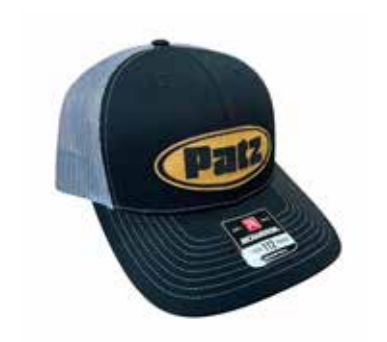
PA-27249 Black & Grey Oval Patch Hat