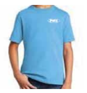
PC54Y Core Cotton Tee 5.4-ounce, 100% cotton (XS-XL) Colors: Aquatic Blue (Shown), Royal, Navy, Charcoal, Black, Sapphire, Bright Aqua, Pink, Lime