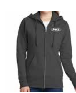
LPC78ZH Full-Zip Hooded Sweatshirt 7.8-ounce, 50/50 cotton/poly fleece

Colors: Charcoal (Shown), Royal, Navy, Dark Heather Grey, Jet Black, Neon Blue