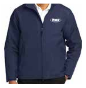
ST970 Colorblock Soft Shell 100% polyester woven shell and a 100% polyester microfleece lining

Colors: Dress Blue Navy/Grey Steel (shown), Deep Black/Grey Steel