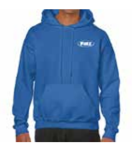
18500 Heavy Blend™ Hooded Sweatshirt 8-ounce, 50/50 cotton/poly

Colors: Dress Blue Navy (Shown), Black, Battleship Grey, Marshmallow