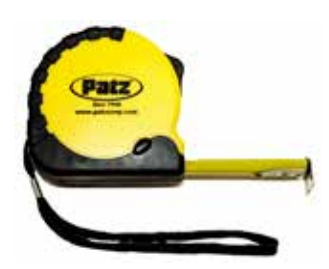
PA-30684 25' Measuring Tape