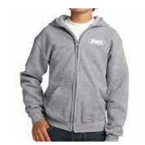
PC90YZH Youth Core Fleece Full-Zip Hooded Sweatshirt 7.8-ounce, 50/50 cotton/poly fleece (XS-XL) Colors: Sport Grey (Shown), Royal, Navy, Black, Red