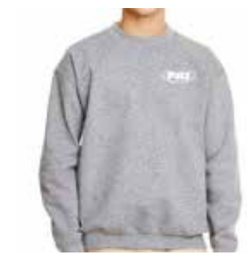
18000B Heavy Blend™ Crewneck Sweatshirt 8-ounce, 50/50 cotton/poly (XS-XL) Colors: Sport Grey (Shown) Royal, Navy, Black, Red