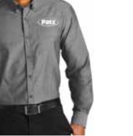
W382 Chambray Easy Care Shirt 2.9-ounce, 60/40 cotton/ polyester chambray

Cloth Vest 12-ounce, 100% cotton enzyme-washed duck cloth 100% polyester black taffeta lining quilted to 6-ounce, polyfill insulation *Possible Long Lead Time* Colors: Navy (Shown) Black, Duck Brown