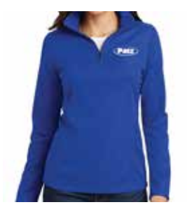
L806 Pinpoint Mesh 1/4-Zip 4.3-ounce, 100% polyester

Colors: True Royal (Shown), Deep Black, Frey Steel, Light Cyan Blue