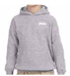
18500B Heavy Blend™ Hooded Sweatshirt 8-ounce, 50/50 cotton/poly (XS-XL) Colors: Sport Grey (Shown), Carolina Blue, Royal, Navy, Charcoal, Black