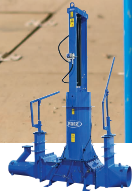
Hydraulic Piston Pump