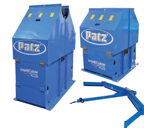
IntelliCable® Alley Scrapers