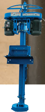
Vertical Pit Pump