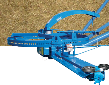
Single Auger Ring Drive