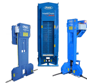
IntelliChain® Alley Scrapers