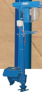
Vertical Electric Prop Agitator