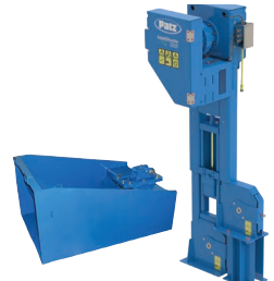
IntelliShuttle® II Chain Box Scraper