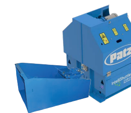
IntelliShuttle® Cable Box Scraper