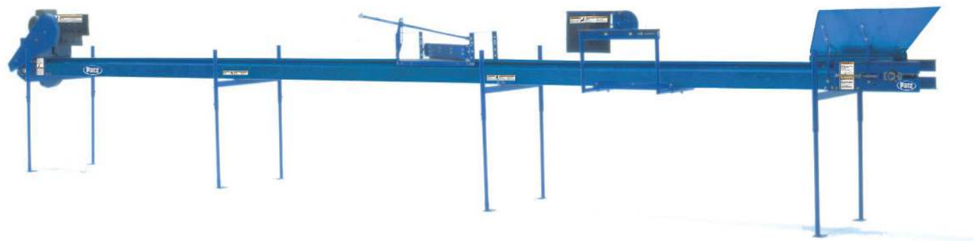
Stands easily adjust to desired height. They also offer support and couple conveyor sections for ease of installation.

The belt uses a proven alligator staple splice of stainless steel or a Clipper® splice. The belt is durable and moves material efficiently. A take-up idler provides for easy adjustment of the belt tension and tracking.