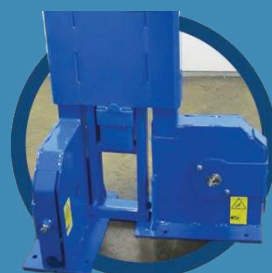
"L" (Corner) Position This setup positions the drive unit in the alley.