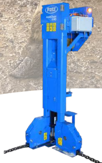
IntelliChain II HD