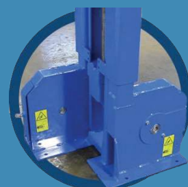
"Z" (Offset) Position Provides space savings by narrowing the space required for the drive. Can be used instead of "straight" position.