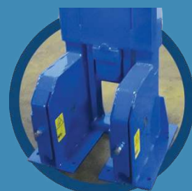
"U" (Parallel) Position Provides space savings and locates the drive unit in a corner out of basic travel routes.