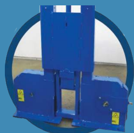
"I" (Straight) Position Most basic setup.

Can be placed in straight, corner, parallel, or offset mounting formations for layout flexibility and space savings (see Drive Unit Configurations below). Steel housing encloses drive unit corner wheels for safety and protection. Corner wheels feature hardened axle and nylon bushings for longer life.